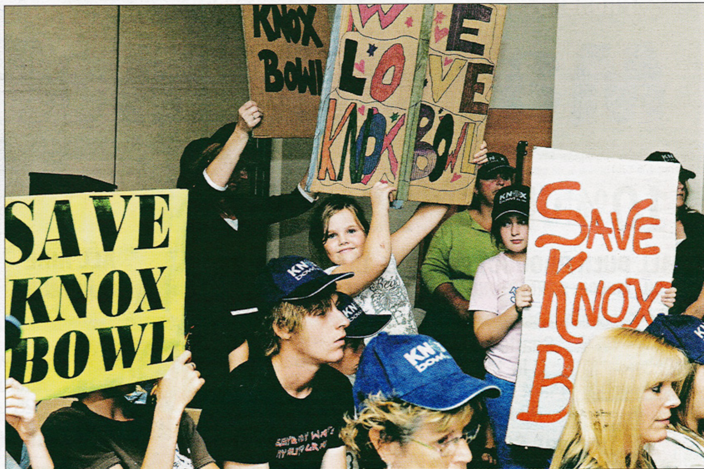
Bowl supporters wait outside the council chambers, gearing up for the big meeting inside.